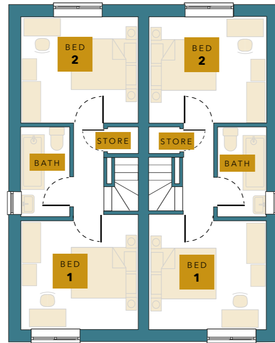
Plots 7, 17 & 19