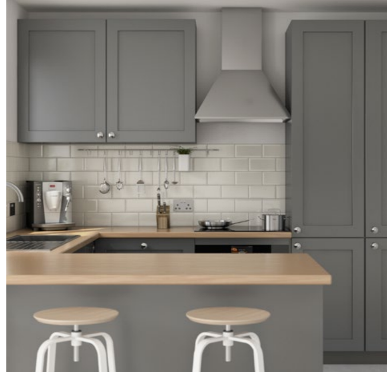
Plots 6, 16 & 18