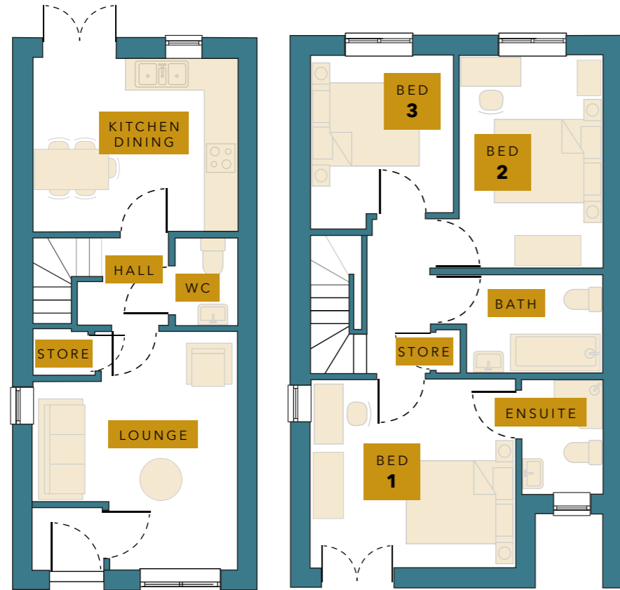
Opposite for Plot 34