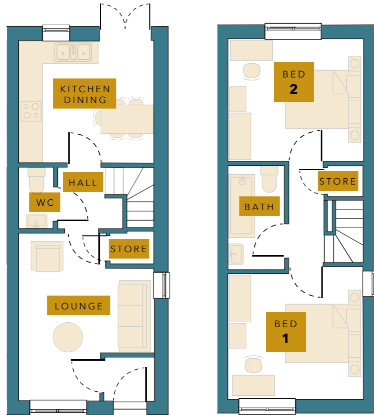
Opposite for Plot 32