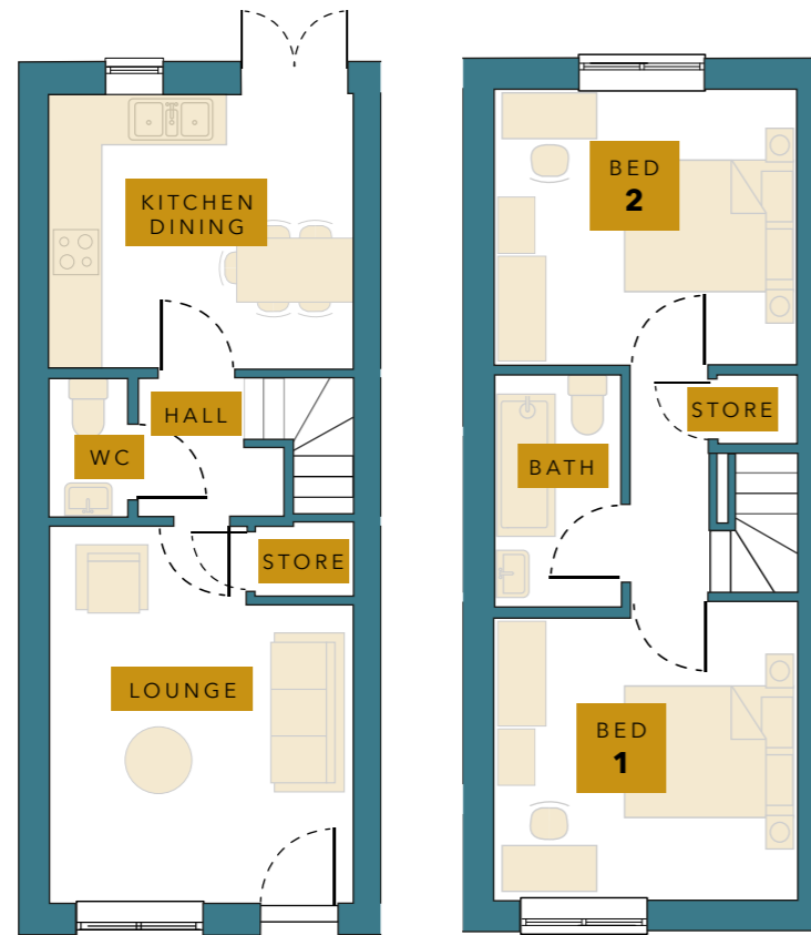
Opposite for Plot 33