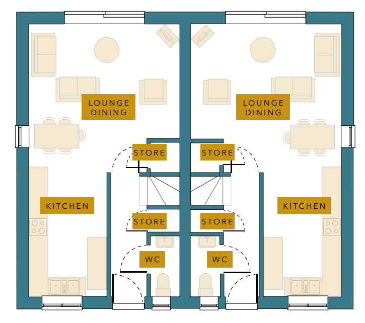
Plots 23 & 25