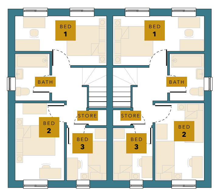
Plots 24 & 26