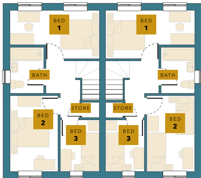
Plots 24 & 26