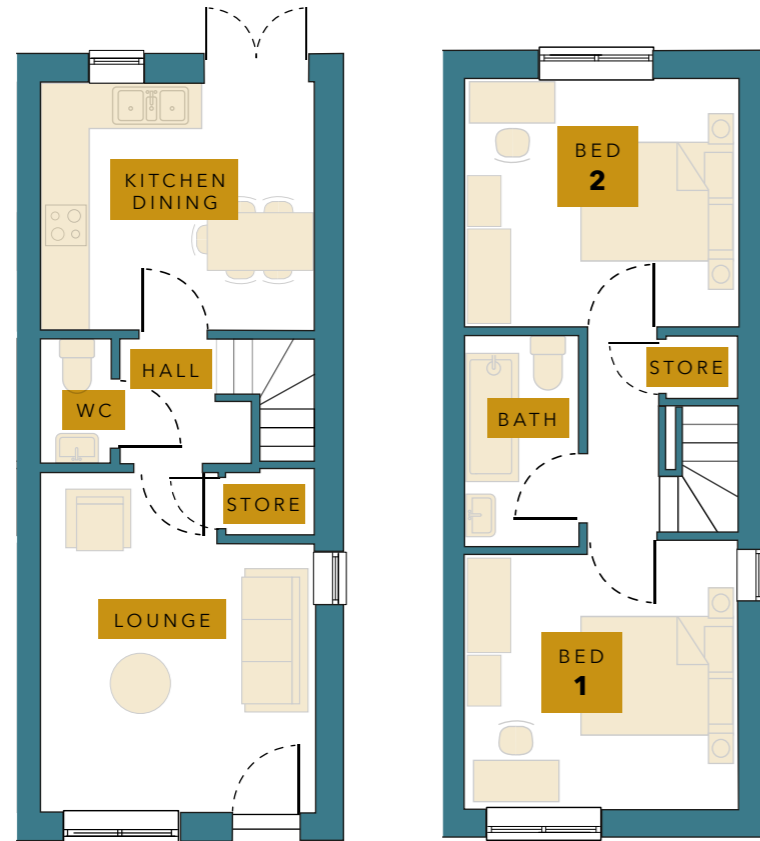
Opposite for Plot 32